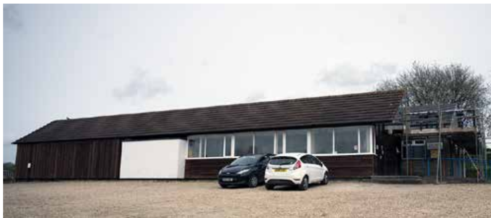
West Meon Village Hall with scaffolding.